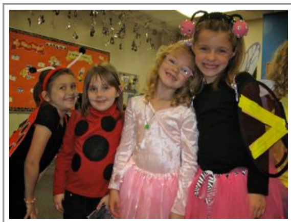
Irvin's cute little "BUGZs".