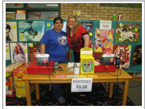
Our parent volunteers are wonderful!