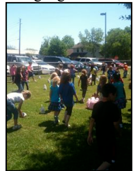
Bunny Bag Hunt!

This has been an exciting six weeks in First Grade! Our first graders are blossoming just like the flowers are this spring! We are so proud of all of their hard work! In Language Arts we have seen blossoming readers and writers. This six weeks we have learned all about U.S. Symbols and Texas in Social Studies. In Science, students experimented with forces. Our first graders have become such mathematicians! Students had to take inventory in our classrooms. They worked to organize in groups by skip counting, then specifically on groups of ten. The concept of place value is developed as the students pack objects into ten and study patterns. We also ended the six weeks by celebrating spring with a bunny bag hunt!