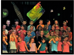
Our kindergarten classes did a wonderful job.

WOW!!! It is hard to believe that we have finished another six weeks. The time is just flying by. We began this six weeks learning about two famous presidents, Washington and Lincoln. We also learned about the important symbols of our country. We then studied the Great State of Texas and the wonderful symbols that are important to us. We also learned about different types of weather and the water cycle. We learned the words precipitation, condensation, and evaporation and even checked the weather and temperature every day for a week. We learned that the word oviparous means an animal that lays eggs. We finished up with a unit on dinosaurs, which is always a favorite amongst the kids. We also had an Egg Hunt, Spring Break and a wonderful Music Program during these last six weeks.