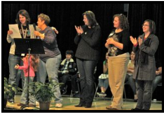
PTV officers award grant money to fourth grade.