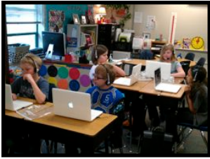
Third grade enjoys learning Spanish!