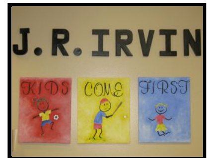
Our students come first at J.R. Irvin!