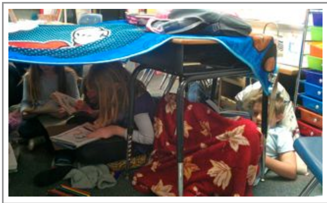
Irvin students enjoy reading.