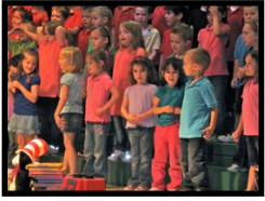
“Bebopping Through Kindergarten”