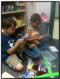
Second Grade Mathematicians!

This has been an exciting six weeks in First Grade! Our first graders are blossoming just like the flowers are this spring! We are so proud of all of their hard work! In Language Arts we have seen blossoming readers and writers. This six weeks we have learned all about U.S. Symbols and Texas in Social Studies. In Science, students experimented with forces. Our first graders have become such mathematicians! Students had to take inventory in our classrooms. They worked to organize in groups by skip counting, then specifically on groups of ten. The concept of place value is developed as the students pack objects into ten and study patterns. We also ended the six weeks by celebrating spring with a bunny bag hunt!